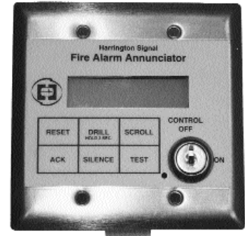
Remote Annunciator LCD with SENSESMART™ RALCD

The Remote Annunciator is also used for programming the HS-2402 LED fire control panel when a ZDACT is being used.